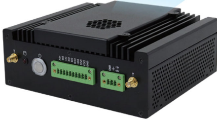
Hailo-8™ M.2 AI Module