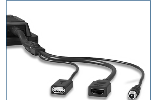
extension cable for IP65