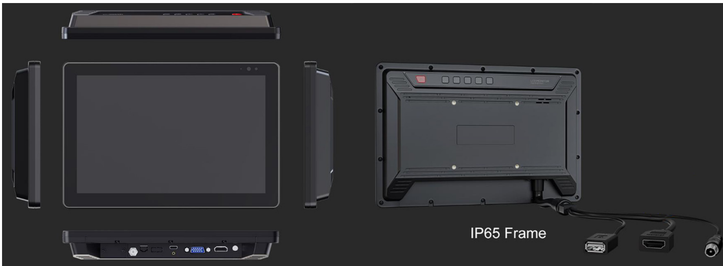
all views IP6X 10.1