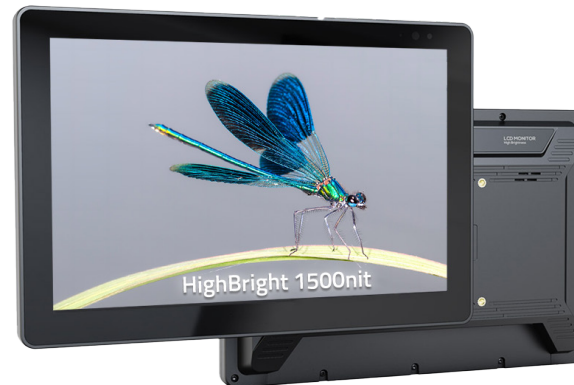
IP6X 7.0 HB with PCAP Touch