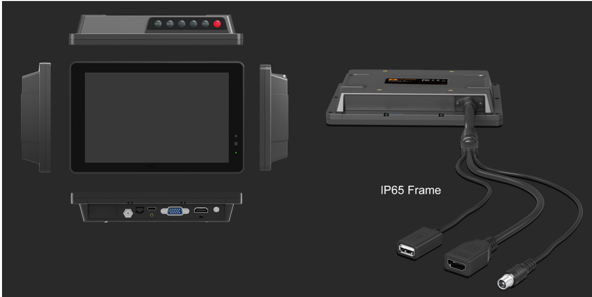
all views IP6X 7.0