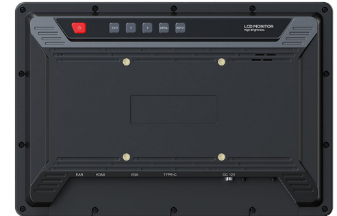
Monitor IP6X 10.1 back view