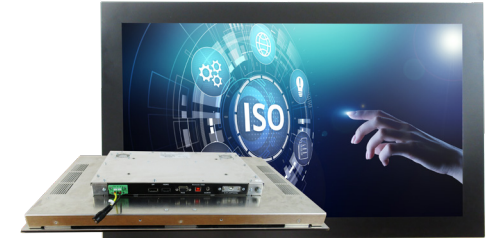
POS-Line HB 21.5 frame monitor with touch screen